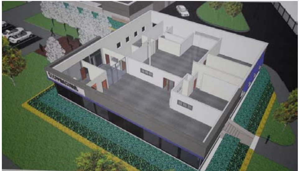
Check out the new digs!