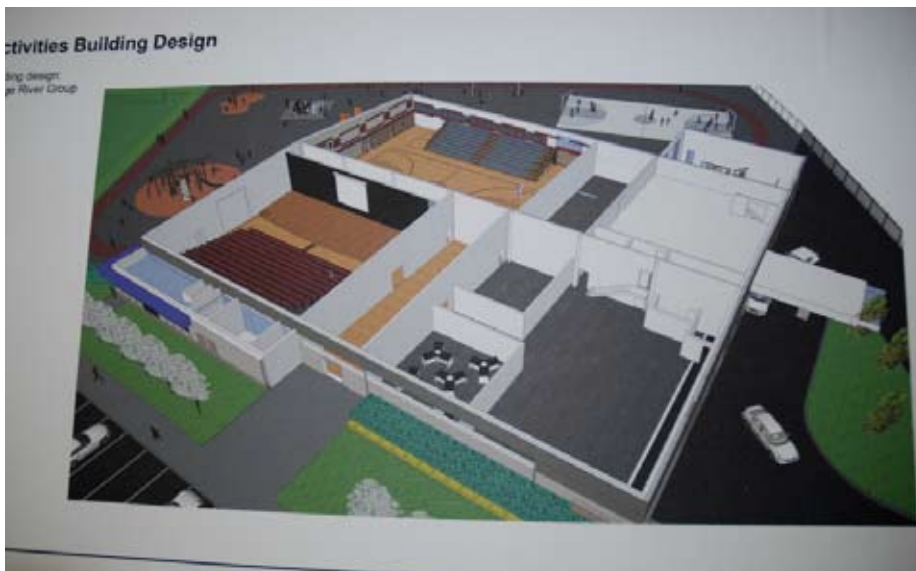
This is a little further ahead, but it'll be great to have