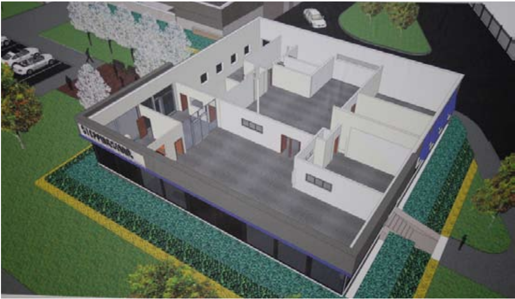
Check out the new digs!