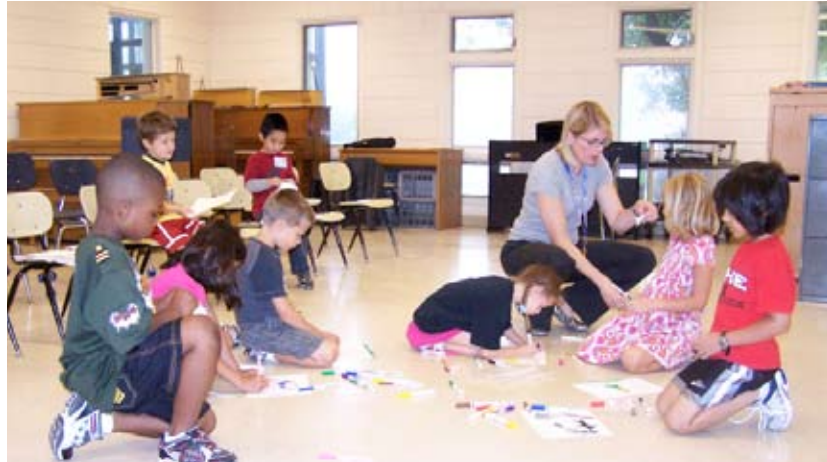
Getting to know you in Drama class

28555 Middlebelt Road Farmington Hills, MI 48334 Phone: 248.539.1666 Fax: 248.539.1929 www.steppingstoneschool.org